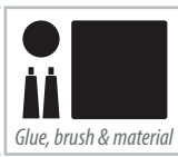
Repair kit (1)