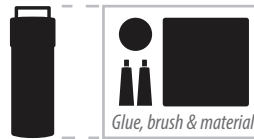
Repair kit (1)