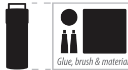
Repair kit (1)