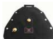
6 or 9 gl fuel bladder