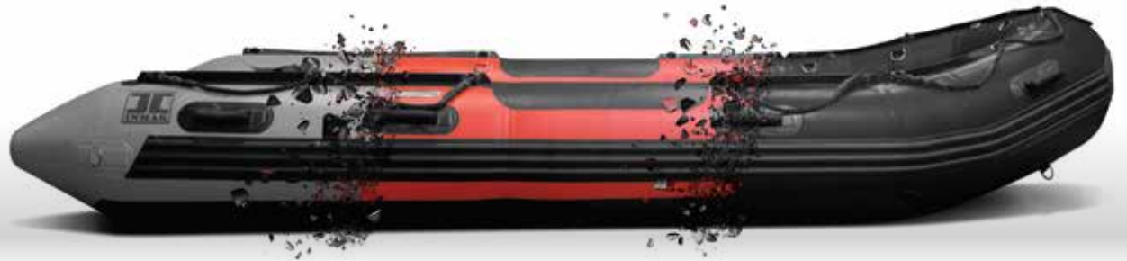
PATROL - GREY (PT)