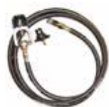
Quick inflation system