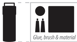
Repair kit (1)